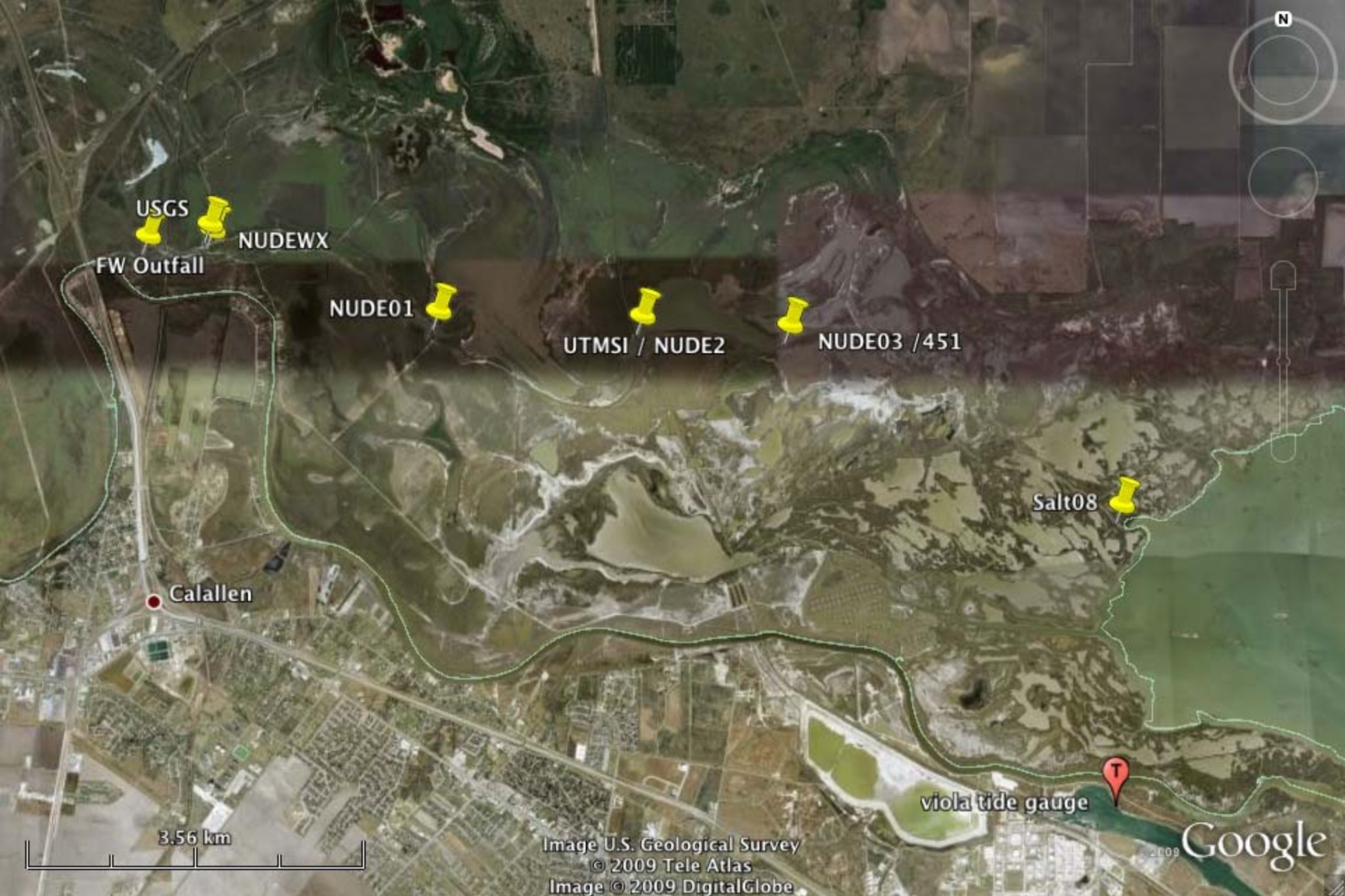
Rincon Bayou salinity monitoring stations and diversion pipeline outfall.