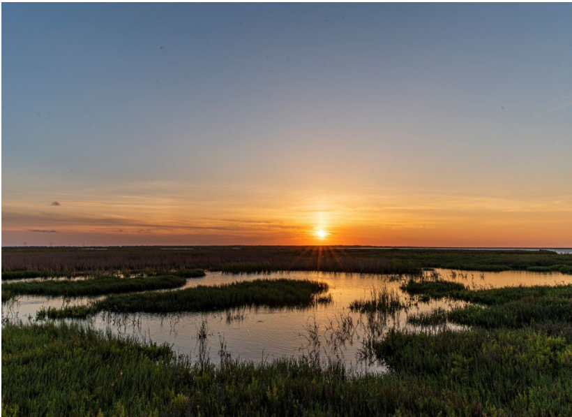
Right Photo - JD Murphee WMA in 2024, 14 years following placement of dredge material

It's important to realize that the Nueces Delta that exists today is not in an ideal state and has been incrementally declining for nearly 50 years without much intervention. With 14 ft of shoreline disappearing every year, there wouldn't be much of a delta left for future generations unless action was taken. Both the shoreline protection breakwater structures and sediment replenishment projects have the potential to give the delta a fighting chance against the ongoing threats it faces, but the recovery efforts will take time. The CBBEP is dedicated to continued monitoring of this restoration effort and adjusting our management strategies as necessary to ensure the habitat is restored and preserved.