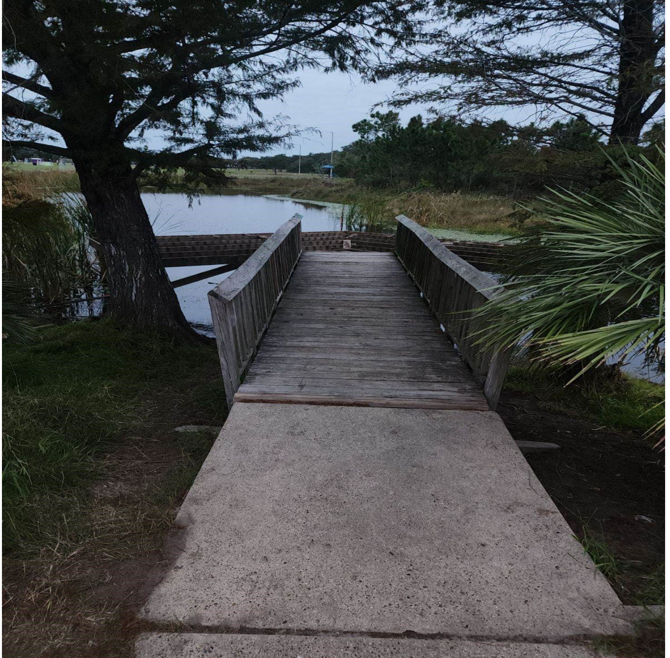
Existing Pier Before Demolition

Upon initial inspection, it was found that the pier's pylons did not need to be replaced. However, all floor joists, decking, railings, and benches were removed and replaced with treated pine & Southern Pine lumber. The hardware was replaced using stainless steel hex bolts, stainless steel nuts & stainless-steel washers. These materials were chosen to extend the life of the rebuilt pier allowing for its use by the public for many years to come.