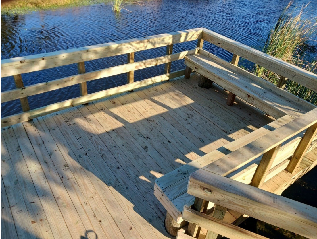
Left Side of Rebuilt Pier and Benches at Waldron Park Pond